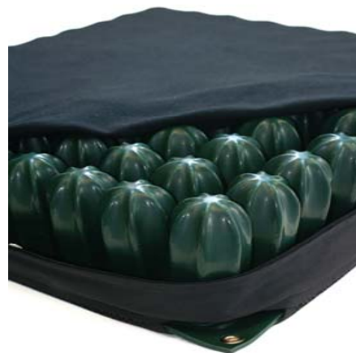
Cushion and Cover

The distance between the deepest point of a sitting person (usually the ischial tuberosities) and the base of the cushion should be approximately \frac{3}{4} of an inch or 2 cm.